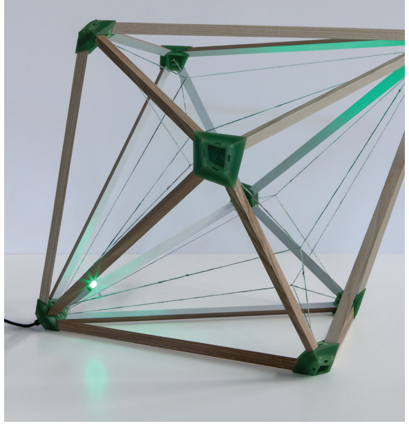
OLAFUR ELIASSON – GREEN LIGHT | AN ARTISTIC WORKSHOP GREEN LIGHT – SHARED LEARNING TBA21 – AUGARTEN

critics and the public are now looking for something with morality—something that tries to have an effect for the good of the world. TBA21 is doing such, taking art out of the studio and science out the lab, bringing the two together to establish a new paradigm for how we understand and act on environmental issues. Collaborative ideas between the disciplines are explored on the Dardanella , a research vessel funded by the foundation that sails the oceans, and at the annual foundation meetings, where researchers come together before and after expeditions to discuss their collaborative projects, brainstorm, evaluate and dream.