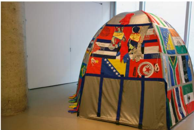
Lucy + Jorge Orta, "Antarctic Village – No Borders, Dome Dwelling" (2007), coated polyamide, various textiles, nation flags, silkscreen print, second hand clothes, webbing, clips, 3 telescopic armatures