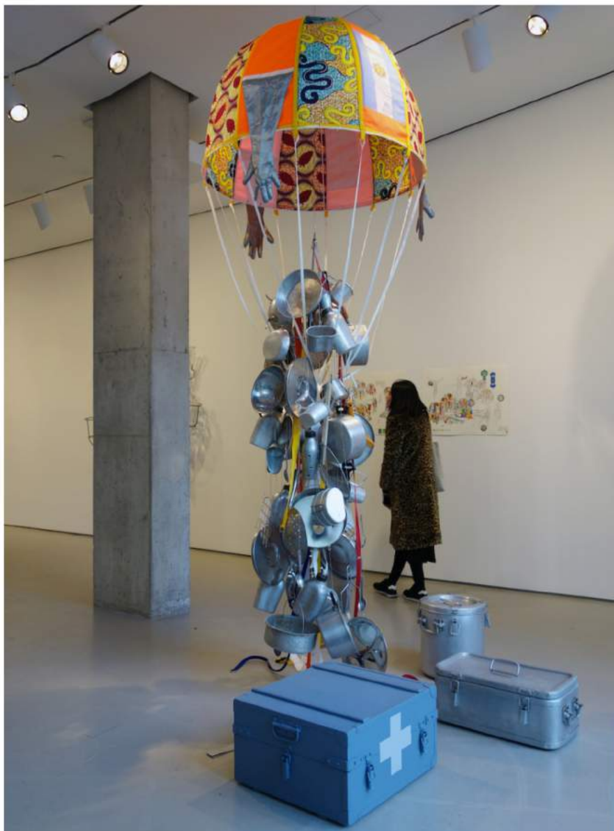
Lucy + Jorge Orta, "Antarctic Village – No Borders, Drop Parachute" (2007-08), coated polyamide, steel armature, various textiles, nation flags, kitchen utensils, objects, silkscreen print, webbing, Red Cross crate

A century ago, the Endurance Expedition to Antarctica was stranded on the remote, frigid continent, their ship shattered and hope for rescue slim. Led by explorer Ernest Shackleton , the expedition crew managed to survive through an 800-mile journey on a small 22-foot ship. The experience is considered the end of the Heroic Age of Antarctic Exploration , which included international competitions to reach the South Pole, and work across country borders to research the unexplored landmass.