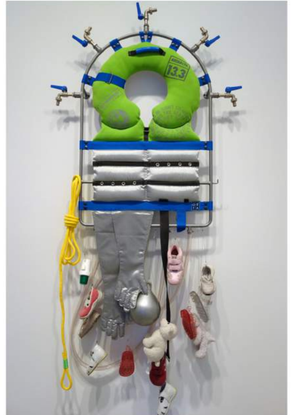
Lucy + Jorge Orta, "Life Line – Survival Kit" (2008), steel frame, piping, 5 taps, various textiles, silkscreen print, webbing, children's shoes, float, warning light, rope, 59.06 x 31.5 x 5.91 inches