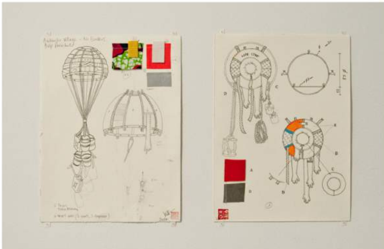
Lucy + Jorge Orta, "Antarctica – Drop Parachute" (2008), pencil, pigment ink, fabric samples on Fabriano paper; "Antarctica – Life Line" (2008), pencil, pigment ink, fabric samples on Fabriano paper