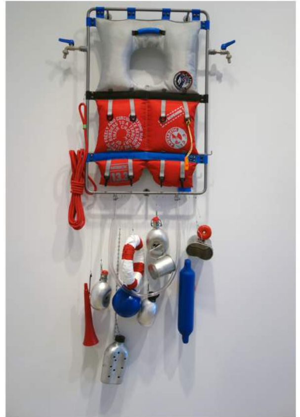
Lucy + Jorge Orta, "Life Line – Survival Kit" (2008), steel frame, 2 taps, piping, various textiles, silkscreen print, webbing, rope, 2 floats, ring, horn, various water flasks and containers, 59.06 x 31.5 x 5.91 inches