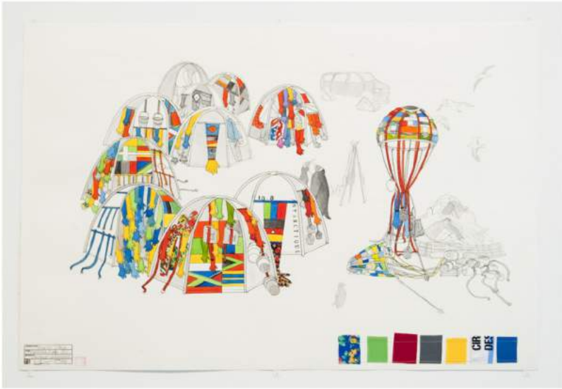
Lucy + Jorge Orta, "Antarctic Village – No Borders, expedition diary" (2006-07), pencil, pigment ink, water color, fabric samples on Fabriano paper