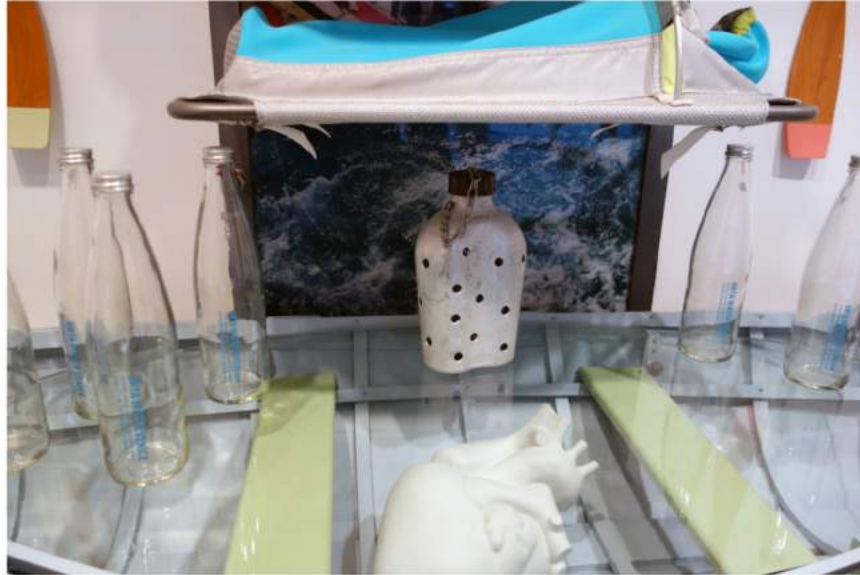
Lucy + Jorge Orta, "OrtaWater – Antarctica" (detail) (2006), wood, diverse textiles, steel, laminated Lamda photograph, 1 water flasks, 6 OrtaWater bottles, Royal Limoges porcelain, 2 oars, 59.06 x 59.06 x 23.62 inches 150 x 150 x 60 cm

In the utopic vision of the Ortas, Antarctica is a last refuge from global conflict and its rigid borders, where anyone can belong, and the only way to survive is through collaboration. Come 2048, the 1991 Madrid Protocol that prohibits mining in Antarctica will be up for review, and the resources buried beneath the icy surface may be too enticing for corporations. Climate change, like this distant, southern tip of our world, can often feel abstract, but Lucy and Jorge Orta are hoping to engage people with its importance, one passport at a time.