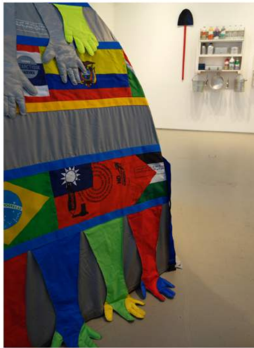
Installation view of 'Lucy + Jorge Orta: Antarctica' at Jane Lombard Gallery

Antarctica remains a powerful place of international collaboration for survival in one of the planet's most extreme environments. To encourage public awareness of the ongoing role of Antarctica in global cooperation, especially in the scientific research on climate change (this is where the Ozone Hole was discovered ), France-based artist duo Lucy and Jorge Orta launched the mobile Antarctic World Passport Delivery Bureau in 2008 where anyone can pledge citizenship to the southernmost continent. The Bureau is currently in operation at Jane Lombard Gallery in conjunction with Antarctica , their first New York City solo show. (You can also request a virtual passport online .)