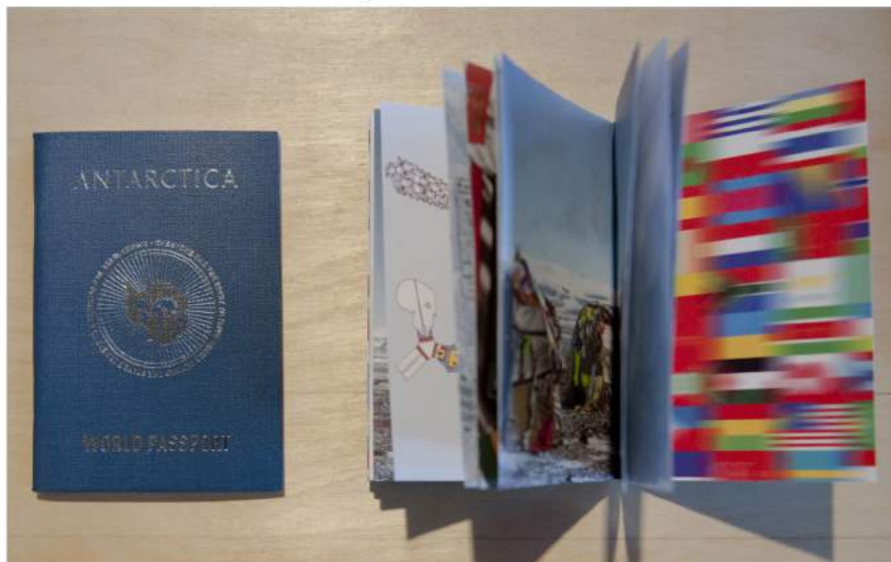
Antarctica World Passport

You don't actually need a passport to visit Antarctica, as the 1959 Antarctic Treaty , now signed by 53 nation states, affirmed it as a peaceful territory free from country ownership. The Antarctica World Passport is completely symbolic, an advocacy tool to engage people around the world in the importance of a remote place most of us will never visit. Before Jane Lombard Gallery, the Bureau was at the Grand Palais in Paris alongside December's COP21 UN Climate Summit.