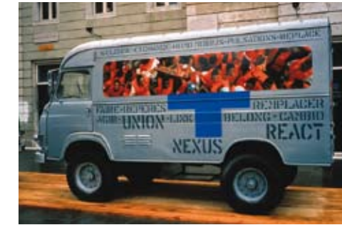
Caption Title info and Date TK