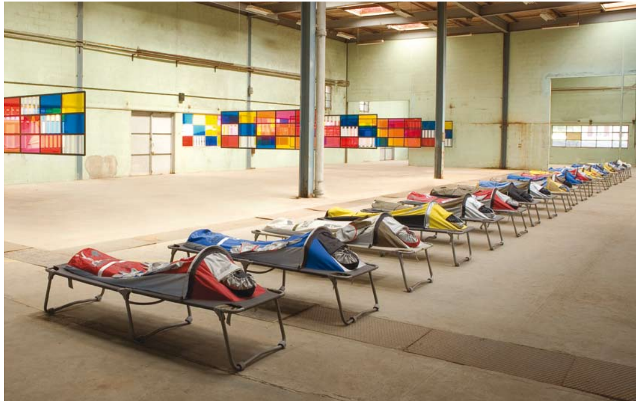
Caption Title info and Date TK