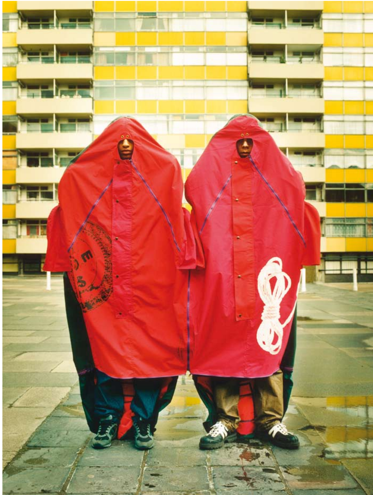
Caption Title info and Date TK