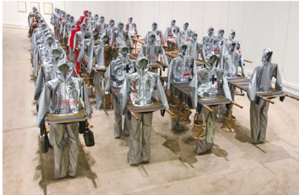
Caption Title info and Date TK

city as a mirror from which he reflected his now-familiar vocabulary of images onto the surface of the churches and palaces along the Grand Canal. A poetic response, the overlapping of images prompted alternative readings and personal interpretations of these emblematic structures.