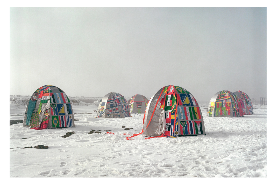
Antarctic Village - No Borders, 2007, by Lucy + Jorge Orta

devices and rubber stamps. Each passport distributed is registered onto an online citizen database, numbered and stamped with a unique identification number.