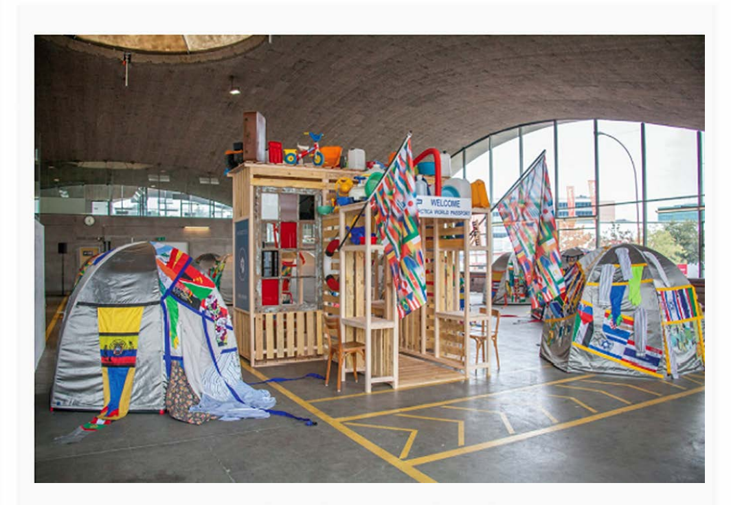
Antarctica World Passport Bureau in the Sicli Pavillon, Geneva, 2015

installations, which create physical one-to-one forums for discussion, which certainly strengthens our resolve to continue creating work that questions the status quo. We're aware that any for any project to be effective it needs to reach a great diversity of people, and for people to take up action we have to continue to search for new artistic strategies. When we look back, we feel like we have only just started!