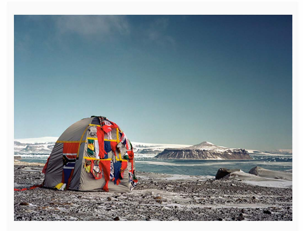
Antarctic Village - No Borders, 2007, by Lucy + Jorge Orta

Antarctica became the symbol for the many iterations of the project today, which include the Antarctic Village, the Antarctica Flag, the Antarctica World Passport, and the various passport office installations.