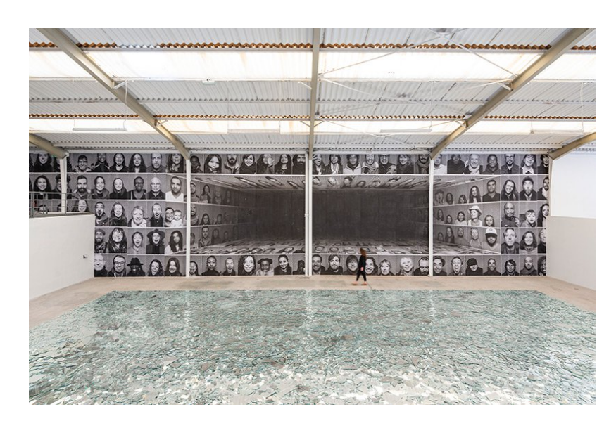
JR, inside out – pouvoir & pouvoir , 2019 inkjet print on pasted paper dimensions | site specific dimensions

from now through september 22, galleria continua, les moulins (https://www.designboom.com/tag/galleria-continua/) brings together 24 diverse artists around the broad and often controversial theme of 'power'. the collective show titled 'pouvoir & pouvoir' confronts the subject from two perspectives: absolute power — the organized authority that oversees others' daily actions; and internal power — the intimate strength that lies within every human being. the exhibited artists have each chosen their own path in reflecting on the theme, some seeing power as potent, and others as potential.