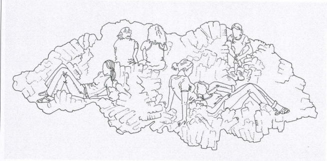
ON CLOUD NINE Left, Orta Studio's Cloud series, initiated in 2011, is produced in a Liverpool workshop, machine-sculpted then cast in resin Above, the inspirational first drawing for the Cloud-Meteoros installation at St Pancras