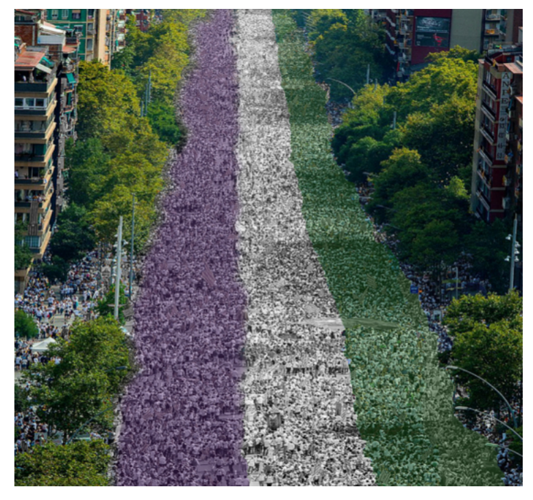
Rendering of Processions 2018, courtesy of Artichoke.

The marches in the four cities across the UK on Sunday aim to become one of the country's largest mass participation artworks. Around 45,000 women and girls are expected to take part, many accessorized in the suffragette colors of purple, white, and green. (Men can show their support from the sidelines.) Called Processions , it has been produced by the arts agency Artichoke and commissioned by 14-18 NOW, the government-backed contemporary arts program that has been marking the centenary of World War I for the past four years.