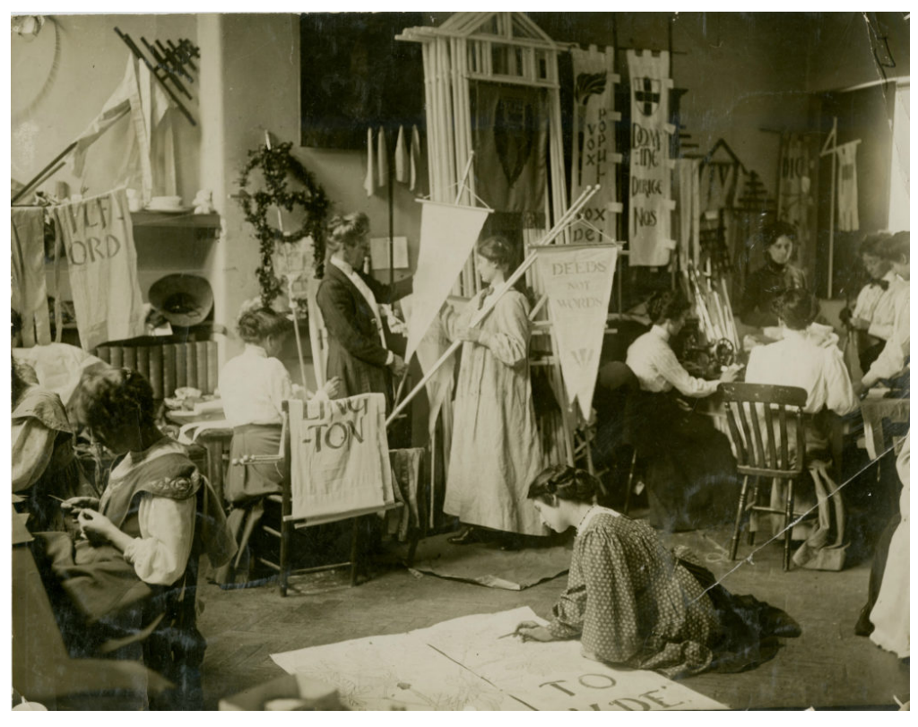
Suffragettes making banners for a Women's Social & Political Union rally, 1910.

Tens of thousands women and girls are due to follow in the footsteps of campaigners for female suffrage when they march with in a colorful procession, banners aloft, in London, Cardiff, Edinburgh, and Belfast on Sunday, June 10. The event, which marks the 100th anniversary of the beginnings of women gaining the right to vote in the UK, is expected to be one of the largest collective performance artworks in the UK's history.